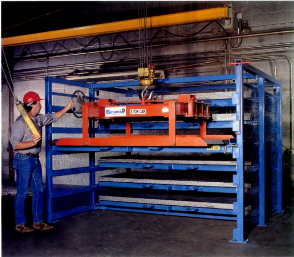
A bundle is easily placed in a drawer with a sheet lift.