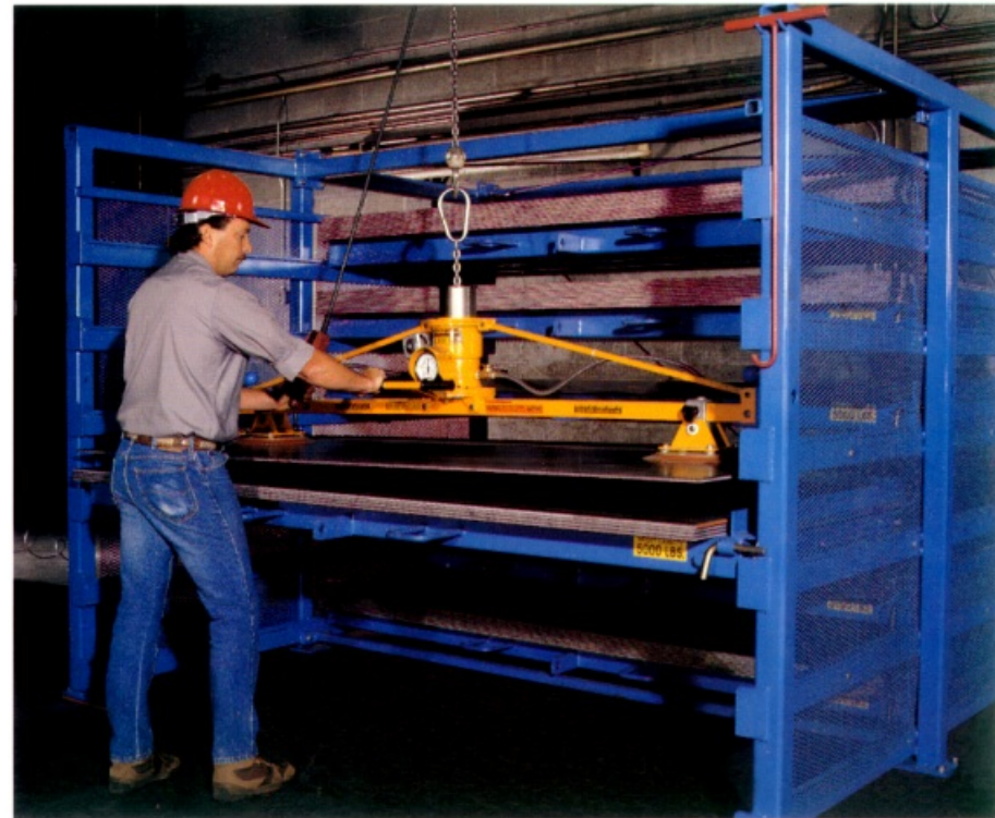
Vacuum lifters are commonly used for retrieving individual sheets.

The convenience of the exposed drawers lends itself to many heavy or delicate flat products. Plates, fixtures, dies, molds and remnants are just some of the different items customers are storing in their racks.