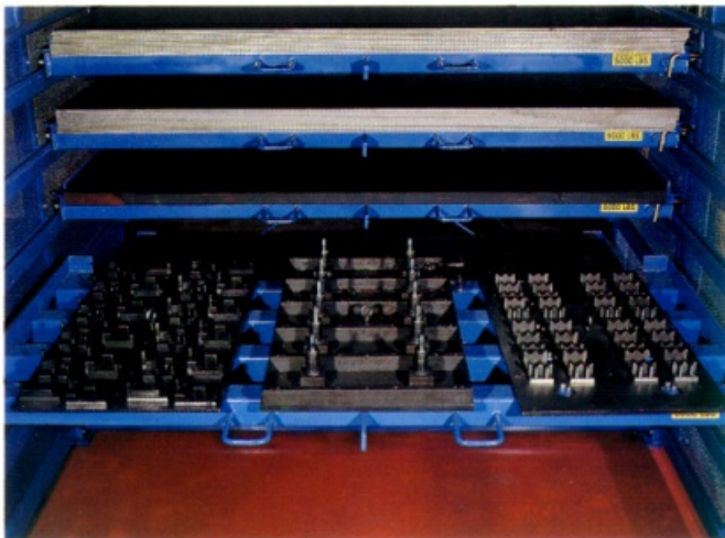
These fixtures are an example of what can be stored besides sheet.