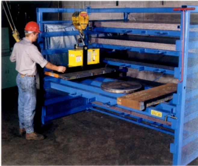
An operator uses a magnet for loading steel plates.