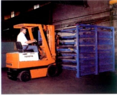
The roll-out drawers complement forklift handling, too.